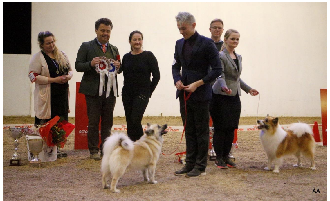
BISS: Stefsstells Dranga Komma & BOSS: ISCh ISJCh RW-17 Sunnusteins Einir