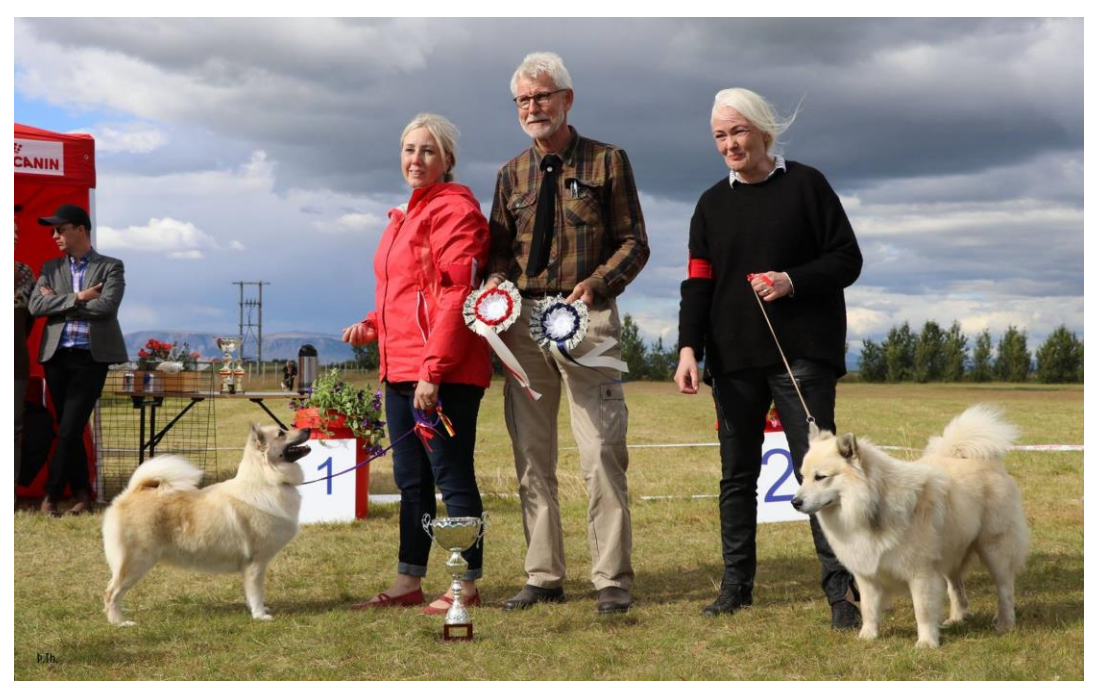
BISS Bjarkeyjar Brák & BOSS ISCH. Heiðarhofs Kolmar (father and daughter)