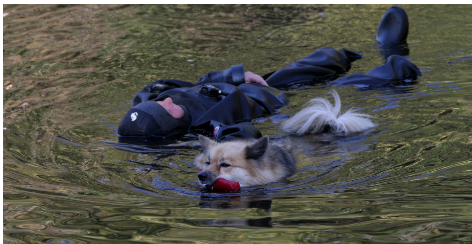
Tunturiketun Nett Freyjubra rescuing a diving person

2010 Nuppusen Natturuperla (Stjarni x Tunturiketun Nett Freyjubra)