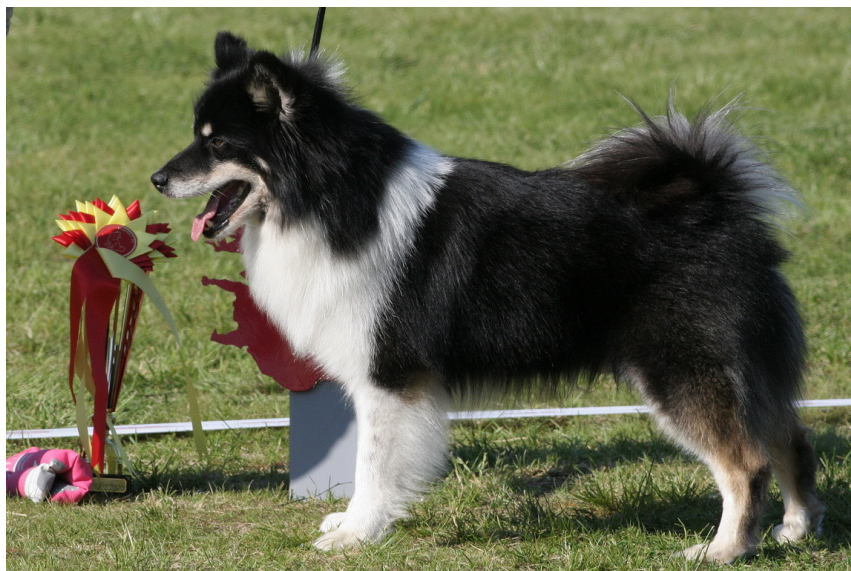
Islanninkoirat ry club show 2014 Kokkola, BOB Vuoreksen Zimba

(2) Vaskur is here as an example of future situation in Finland. People understand very well our recommendation for the numbers of puppies, but they have problems in understanding what will happen in next generations. Now we can easily see that some dogs will get too many grandchildren. Vaskur is the first one of them.