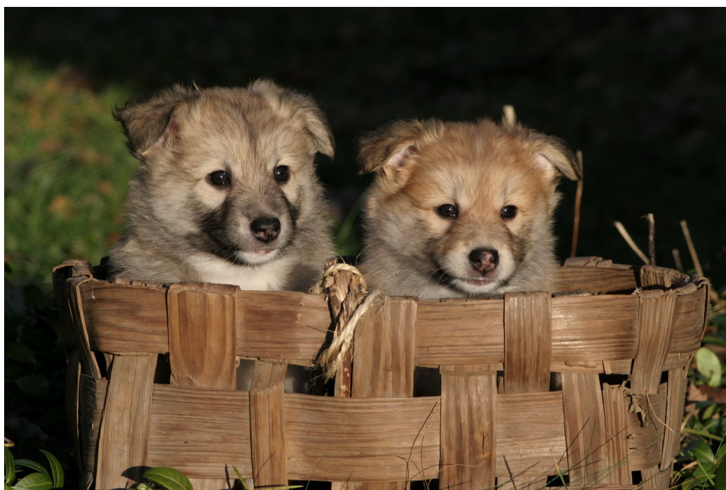
Gelgja's Skirnir & Sudri

Further comments: Year 2013 we made a new registration record. The number of active breeders is now bigger than ever.