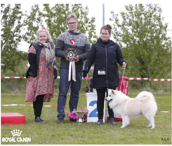
BOSS ISJCh Kolsholts Pengill